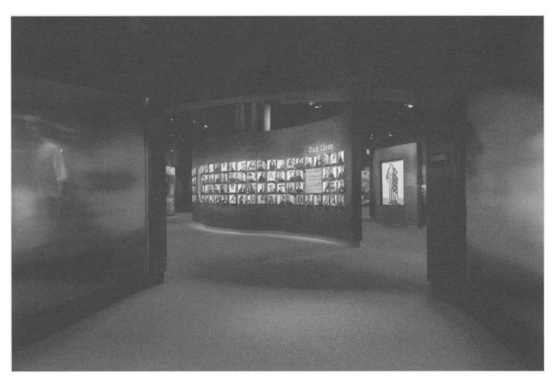
Figure 3. The entryway to "Our Lives" gallery, National Museum of the American Indian.

multiple constructions of history as embedded in every object on display in the museum. The opportunity to read these installations from a multivalent historical perspective is still possible if one recognizes the object as the Indigenous historical text.